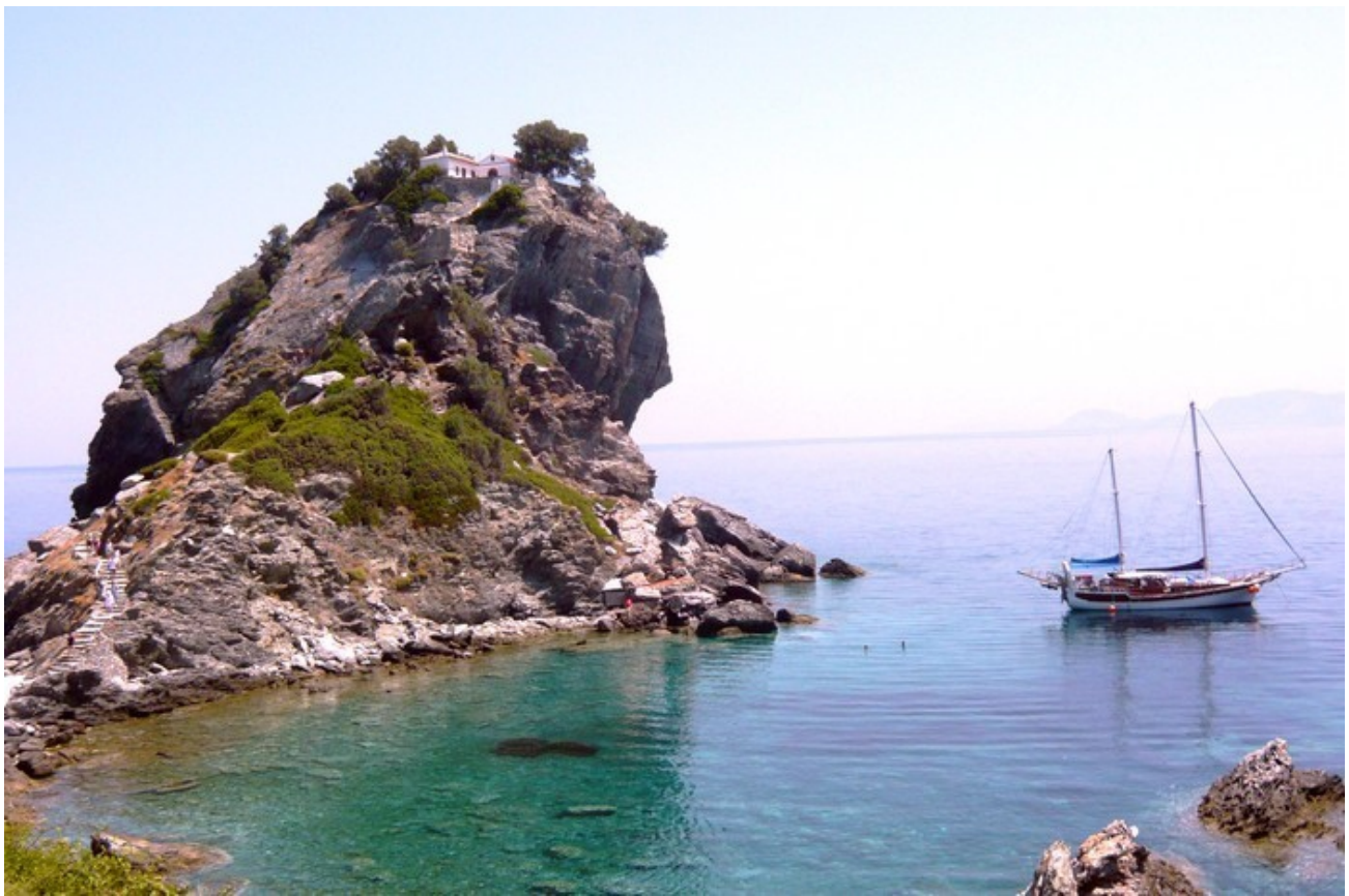
ANATOLIE on anchor under "Mamma mia" Church