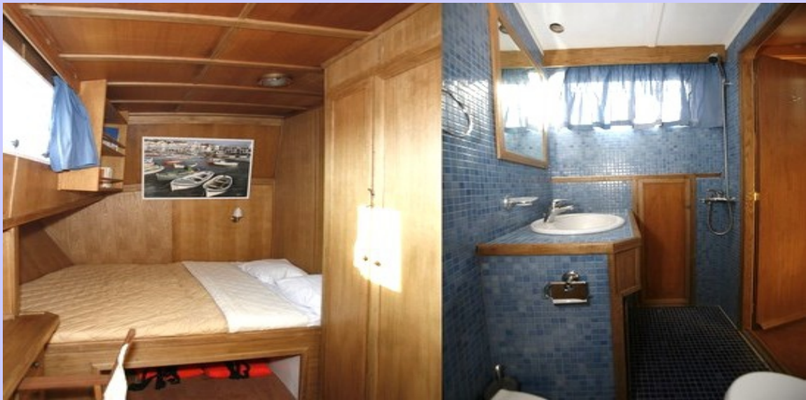
The « Eco » cabin with small private bathroom :

The 3 front cabins of the ANATOLIE are transforming to become Master cabins with queen-size bed. You will enjoy them renewed in 2014 ! This is one Master+ cabin of our other yacht (IRINA) :